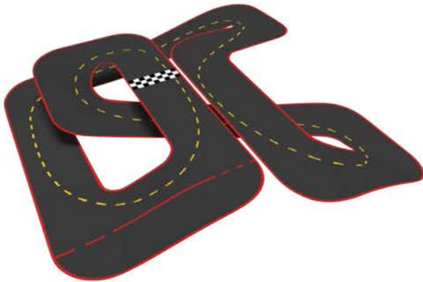
T2 - Circuit de Monte Carlo