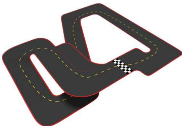
T3 - Circuit de Suzuka